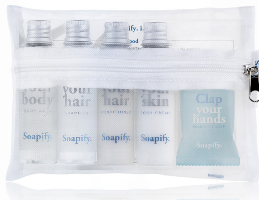
POCHETTE AMENITIES CONTAINS: P41BSP, P41SSP, P41CSP, P41BLSP, B0825SP, CARTSP 17,5 X 12,5 cm K034SP

DERMATOLOGICALLY TESTED NICKEL TESTED NO BHT NO PETROLATUM