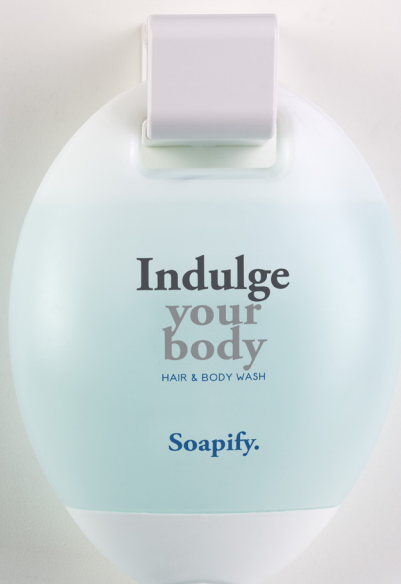
HAIR & BODY WASH 380 ml e 12.84 fl. oz.