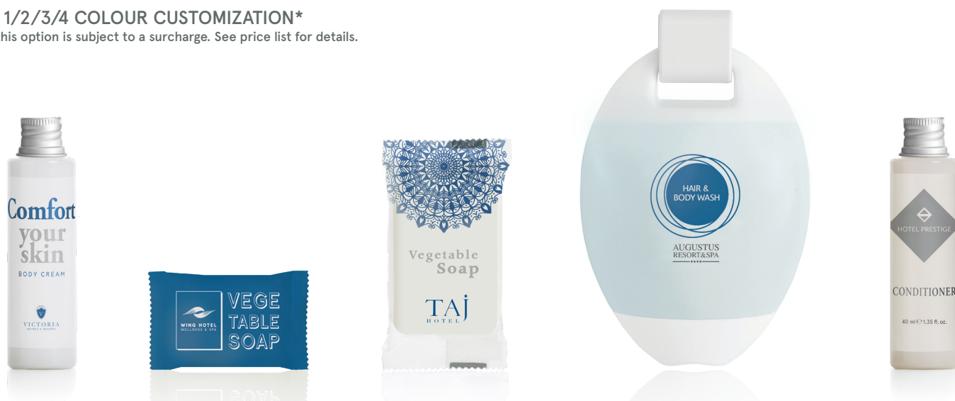
CUSTOMIZATION WITH SAME RANGE COLOURS

*this option is subject to a surcharge. See price list for details.