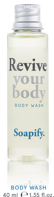
BODY WASH 40 ml e 1.35 fl.oz.