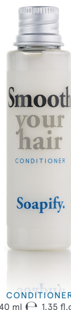
CONDITIONER 40 ml e 1.35 fl.oz.

*Independent Lab tests panel of 20 people for 24 hours.