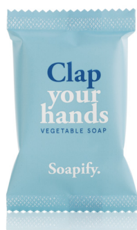
VEGETABLE SOAP 25 g e Net wt. 0.88 oz.