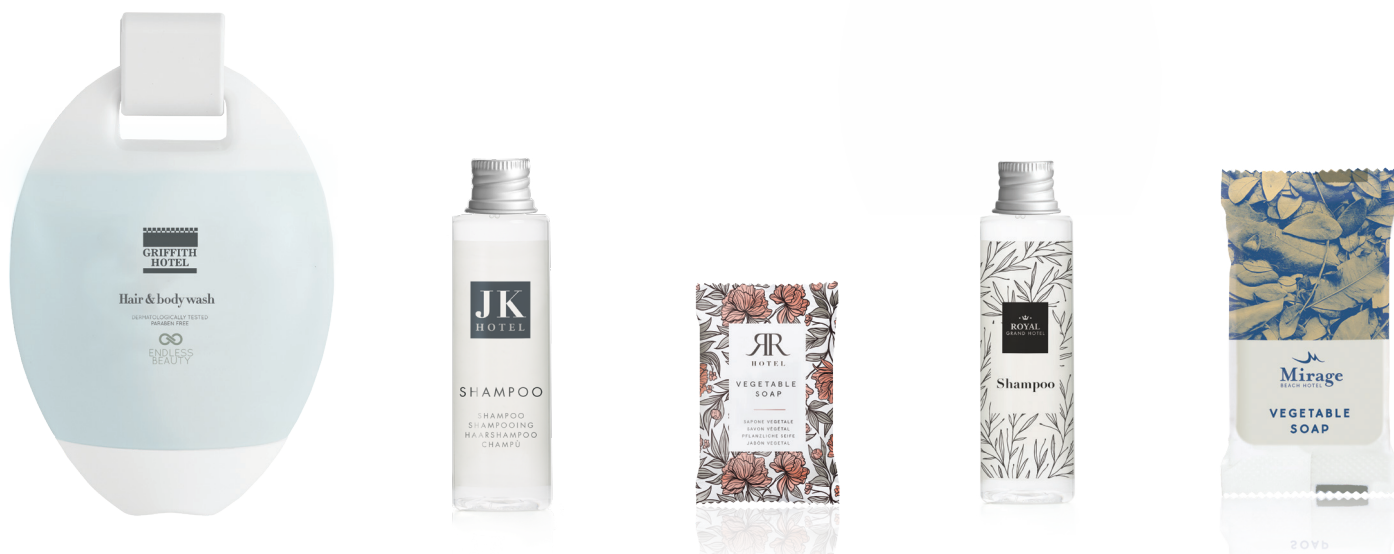
CUSTOMIZATION WITH CUSTOM COLOURS