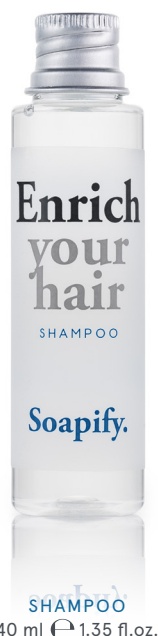
SHAMPOO 40 ml e 1.35 fl.oz.

DERMATOLOGICALLY TESTED NICKEL TESTED NO BHT NO PETROLATUM