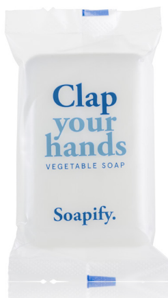
VEGETABLE SOAP 50 g e Net wt. 1.76 oz.