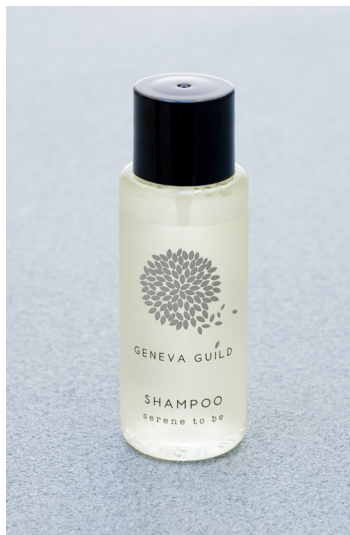
SHAMPOO 30 ml e 1.01 fl. oz. P30SGG

EVALUATION OF THE HYDRATING EFFICACY* This cream increases hydration by +19,3% after 60 minutes leaving skin hydrated also after 24 hours (+9%) *Independent Lab tests panel of 20 people for 24 hours