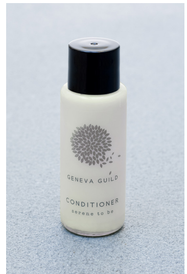
CONDITIONER 30 ml e 1.01 fl. oz. P30CGG

GENEVA GUILD CONDITIONER IS ENRICHED WITH PURIFIED KERATIN AND CAMOMILE EXTRACT TO GENTLY BRIGHTEN, PROTECT AND SMOOTH HAIR.