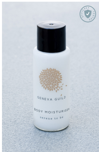
BODY MOISTURISER 30 ml e 1.01 fl. oz. P30BLGG

GENEVA GUILD BODY MOISTURISER IS ENRICHED WITH VITAMIN E AND SHEA BUTTER TO ABSORB QUICKLY AND RESTORE SKIN'S ELASTICITY WHILE DELIVERING SMOOTH, LONG-LASTING HYDRATION.