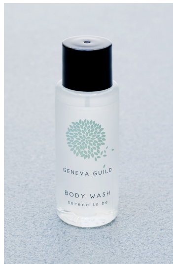
BODY WASH 30 ml e 1.01 fl. oz. P30BGG

GENEVA GUILD BODY WASH GENTLY CLEANS THE SKIN, THE LIGHTLY SCENTED FORMULA IS ENRICHED WITH ALOE VERA EXTRACT WITH SOFTENING AND SOOTHING PROPERTIES.