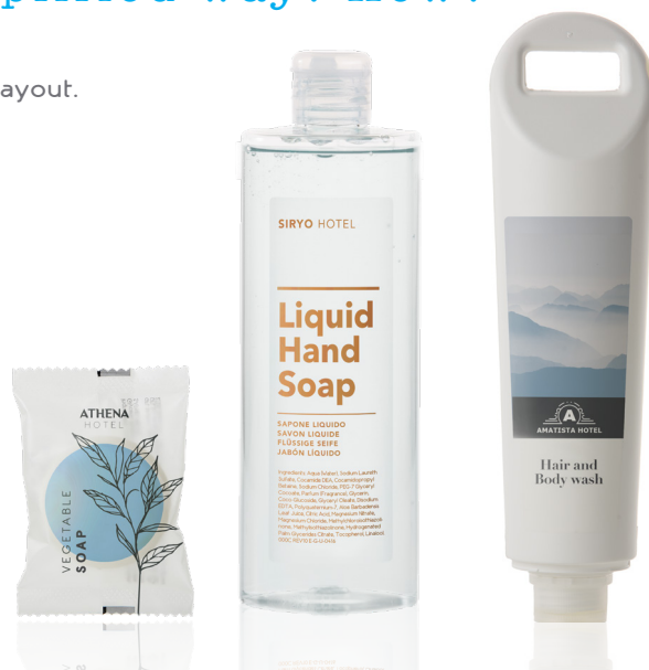
CUSTOMIZATION WITH CUSTOM COLOURS