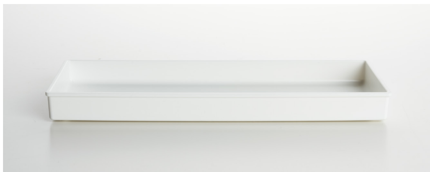
AMENITIES TRAY in white ABS I035ABS