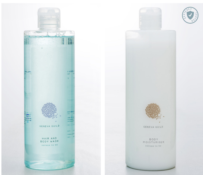
HAIR & BODY WASH 380 ml e 12.8 fl. oz. FLR400MGG

GENEVA GUILD HAIR & BODY WASH GENTLY CLEANS THE SKIN, THE LIGHTLY SCENTED FORMULA IS ENRICHED WITH GREEN ANISE AND ORGANIC MELISSA EXTRACTS WITH PURIFYING PROPERTIES.