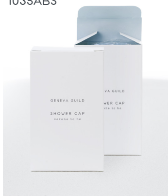
SHOWER CAP in paper case C02MAGG