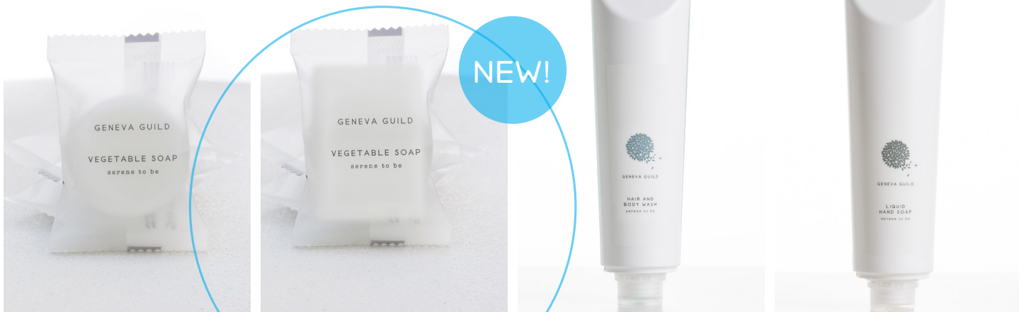
VEGETABLE SOAP 20 g e Net wt. 0.70 oz. B0920GG

GENEVA GUILD VEGETABLE SOAP IS THE IDEAL BODY CARE BAR TO USE ON A DAILY BASIS. ITS GENTLE CLEANSING ACTION CAN BE USED ALL OVER THE BODY TO LEAVE THE SKIN CLEAN AND REFRESHED.