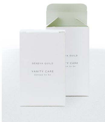
VANITY KIT in paper case DE02MAGG