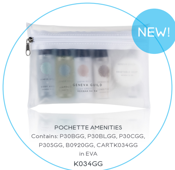
POCHETTE AMENITIES Contains: P30BGG, P30BLGG, P30CGG, P30SGG, B0920GG, CARTK034GG in EVA K034GG