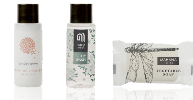
CUSTOMIZATION WITH SAME RANGE COLOURS

*this option is subject to a surcharge. See price list for details.